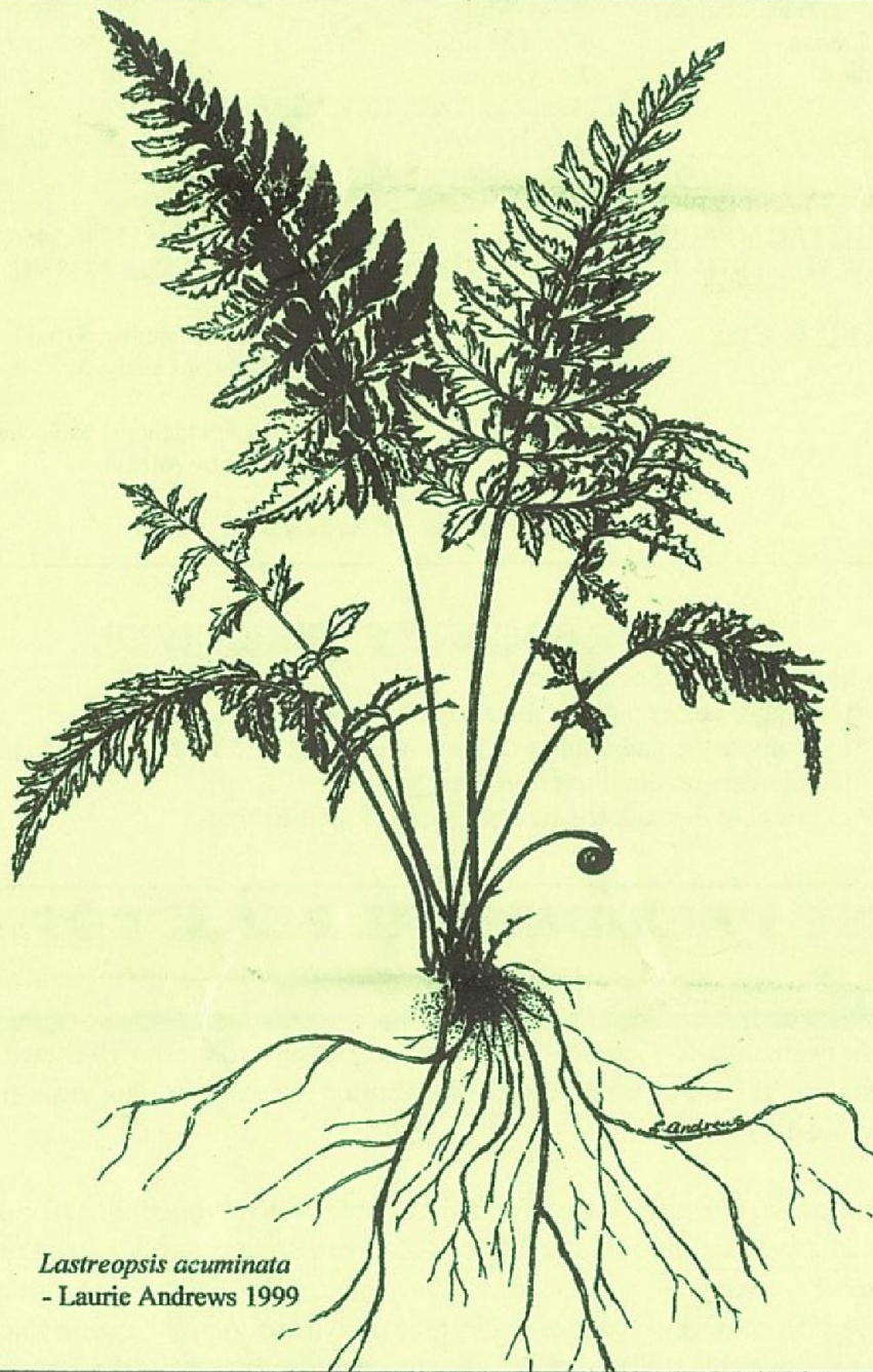
Lastreopsis acuminata